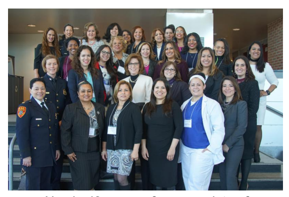
Nearly 40 women from a variety of professions offered their time and encouragement.

Recently, the University offered another program to demonstrate its enduring commitment to diversity and inclusion by encouraging local high school students to achieve their full potential. On Monday, March 6, 2017, more than 240 young women and their 21 chaperones from nine Long Island high schools packed the Stony Brook University Student Activities Center to attend the 2017 Women's Conference: "Women Leaders Paving the Way for Young Women." The message to the students was direct and clear - education can transform your life.