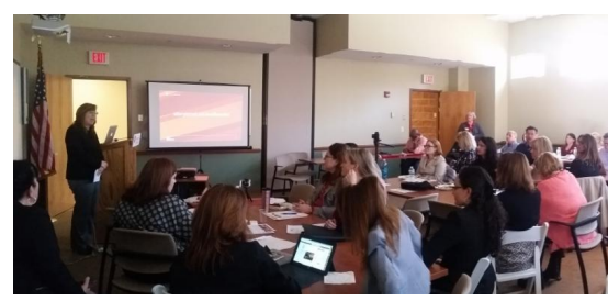
Local businesses and food entrepreneurs packed the multipurpose room to hear business builder information from the University.

A panel of campus experts shared information with chamber members and Incubator tenants for tapping University resources to potentially increase profits, raise awareness, and take their business to the next level.